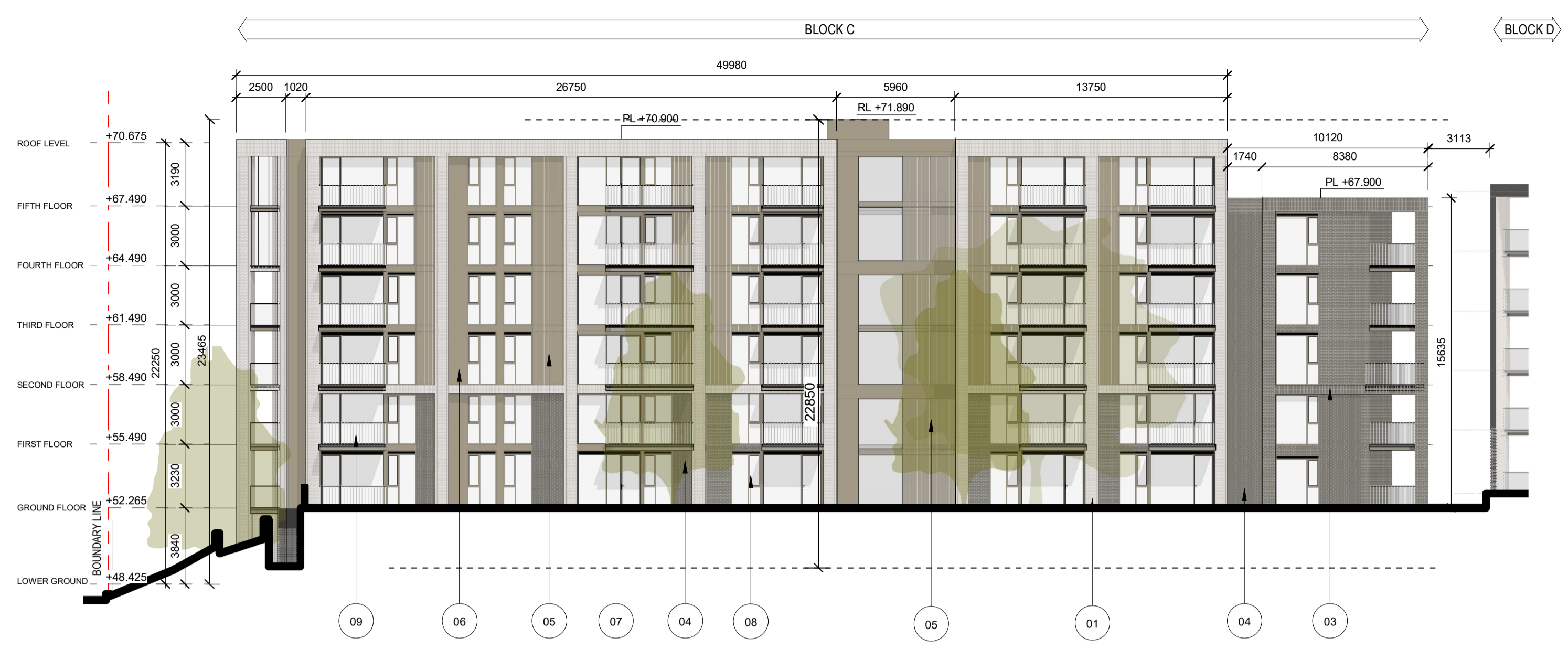
1 BUILDING C - ELEVATION - WEST 1 : 200