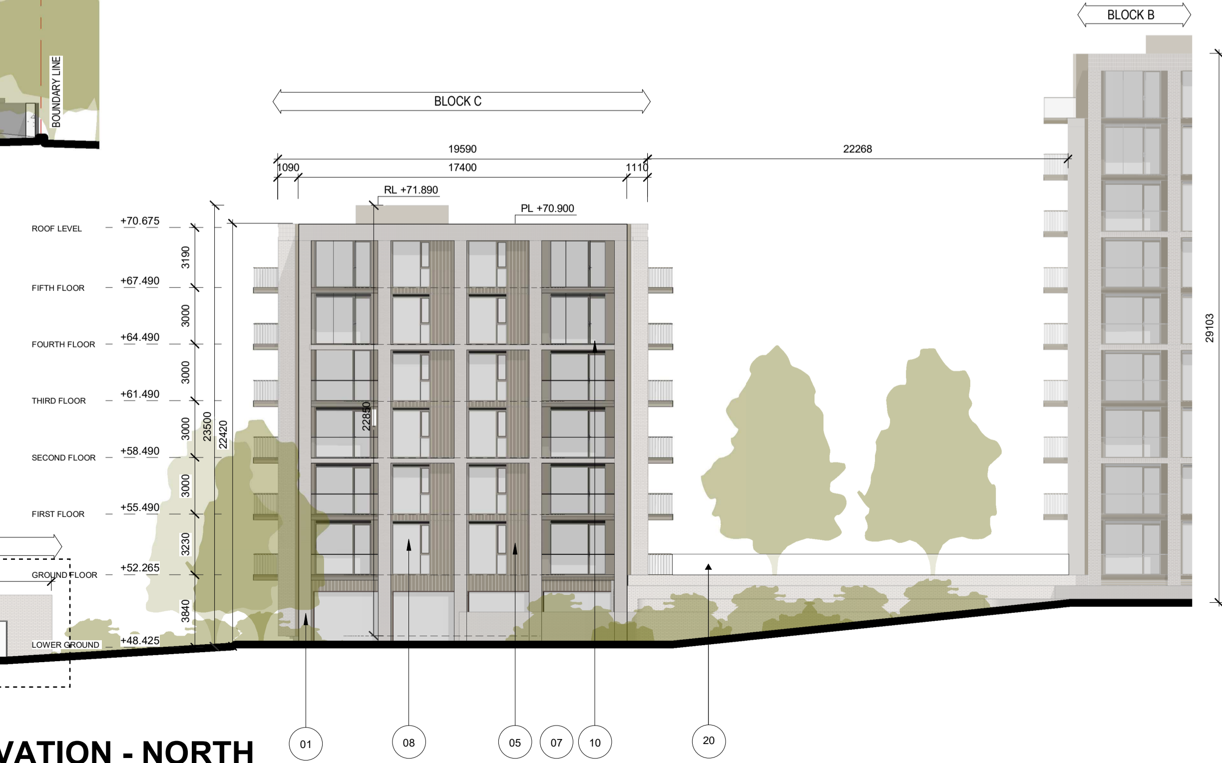
2 BUILDING C - ELEVATION - NORTH 1 : 200

Refer to drawing COR-HJL-ZZ-ZZ-DR-A-0014 for details