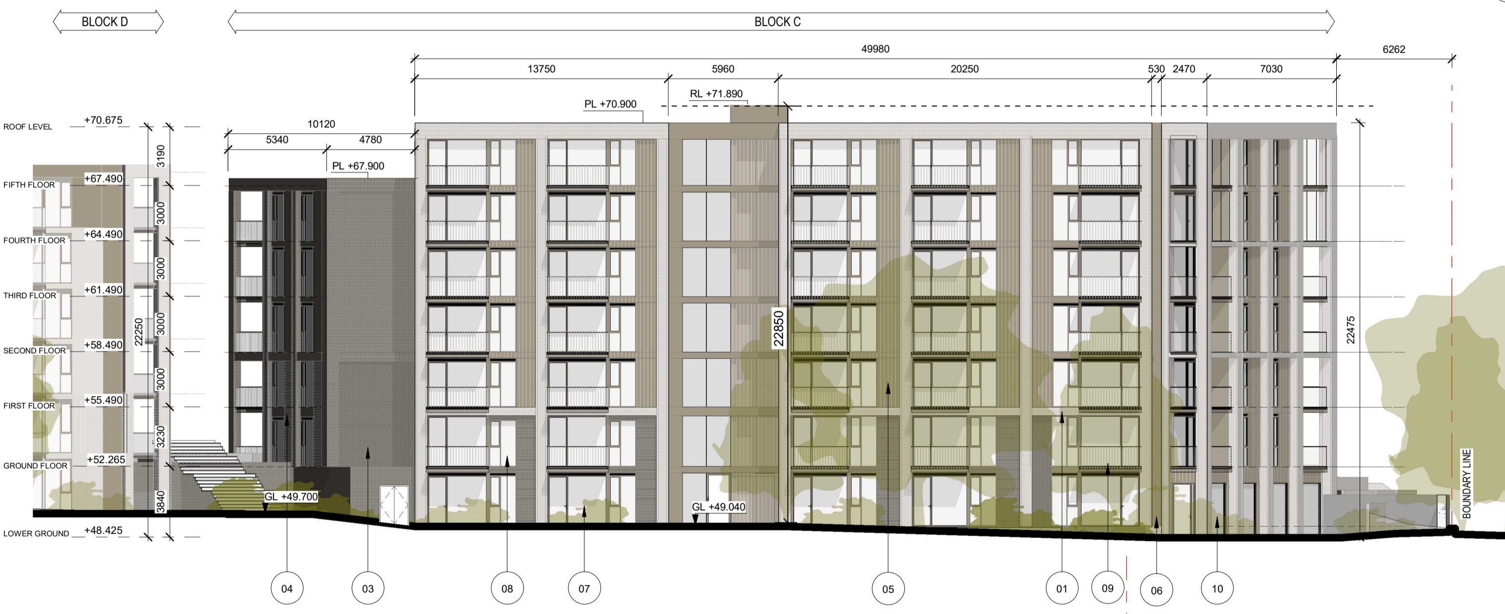
3 BUILDING C - ELEVATION - EAST 1 : 200