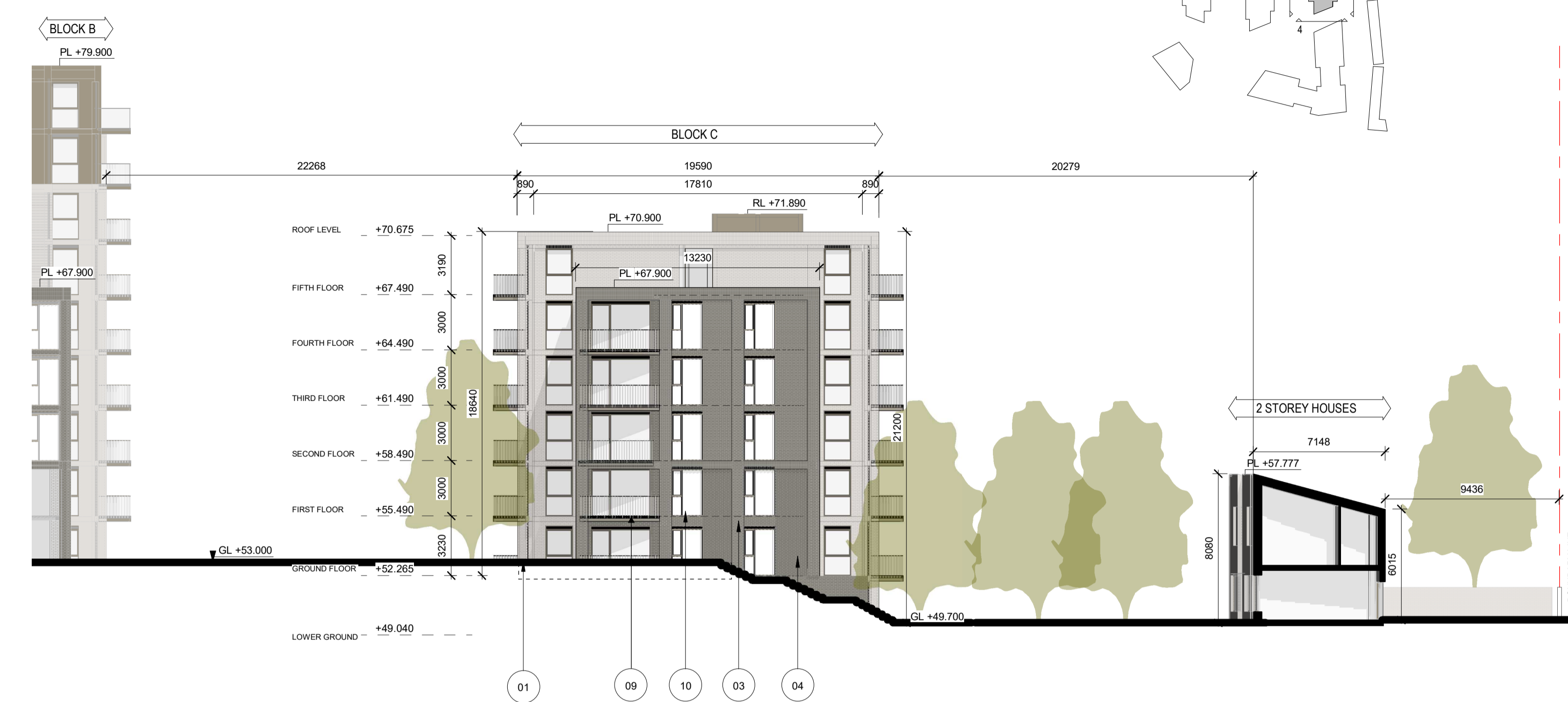
4 BUILDING C - ELEVATION - SOUTH 1 : 200